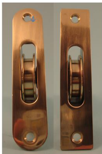
THD190 & THD191